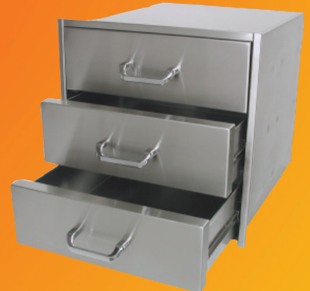
3 Drawer - Wide/Deep