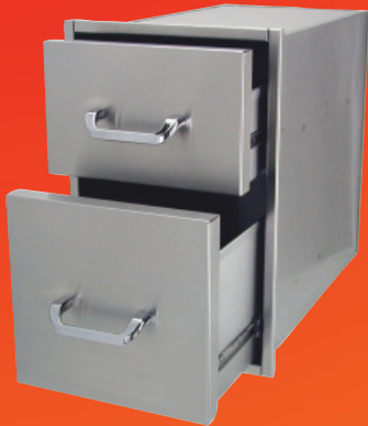
2 Drawer - Narrow/Deep