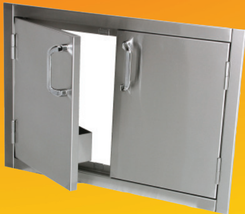
Flush Mount Doors - 21", 30" and 42" (FMD)