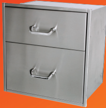
2 Drawer - Wide/Shallow