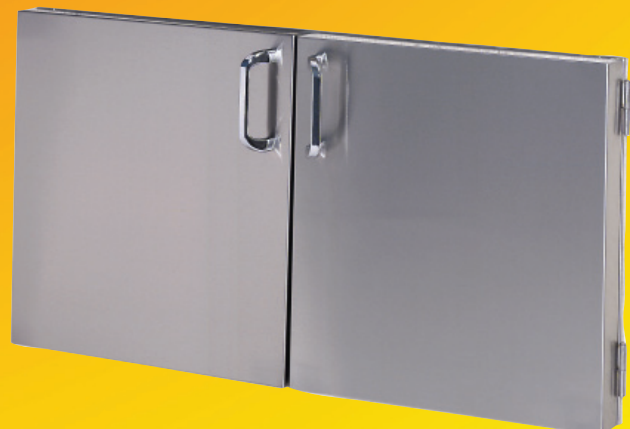
2.5" Offset Doors - 21", 30" and 42" (IRAD)