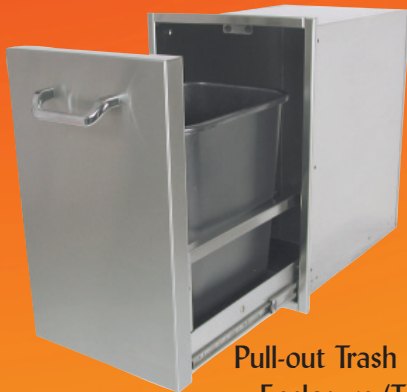
Pull-out Trash Enclosure (TRE1)