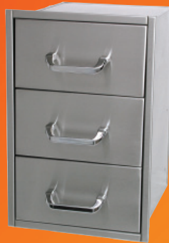
3 Drawer - Narrow/Shallow