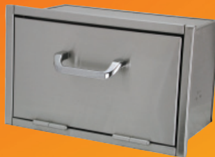
Paper Towel Holder (PTH1)