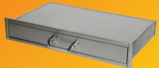
26" wide single utility drawer in 15" and 23" depths