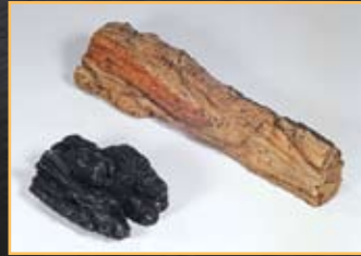
Chunk Kit (CHNK1) for use with ED sets