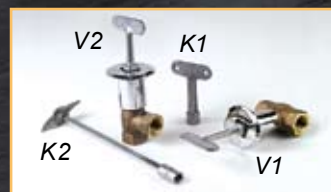
Log Lighter Burners Convenient gas kindling for wood fires