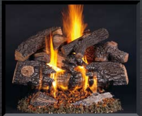
TimberFire (PH) 18-96” (Shown on “LC” burner)

Alterna™ Sets are perfect if you’re looking for something different or less traditional than a wood log set. They are a great complement to modern decor and are available in a variety of styles. Visit rasmussen.biz for more options.