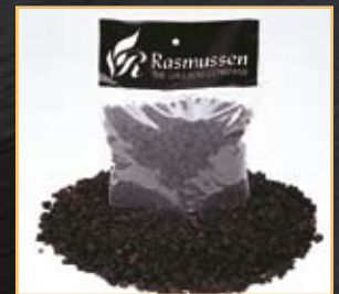
Volcanic Ash (VA) Pan filler for Propane