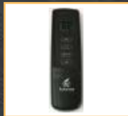
ON/OFF Remote with Thermostat (THR-2R)