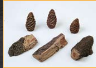
Chunks & Tiny Pine Cones Kit (CKPT)