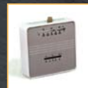
Wall Thermostat (TS-1)