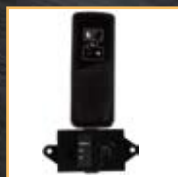
ON/OFF Ultrasonic (F10AB)