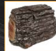
Ceramic Log House for all remote receivers and Crackler (RH2)

Note: Any of these five transmitters will operate the RMC1E, but they do not include the "one touch" shut-down featured on the remote included with the RMC1E