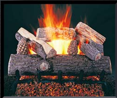
Lone Star (LS) 12-30"