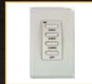
Wall Timer (WT-2R)

Note: Any of these five transmitters will operate the RMC1E, but they do not include the "one touch" shut-down featured on the remote included with the RMC1E