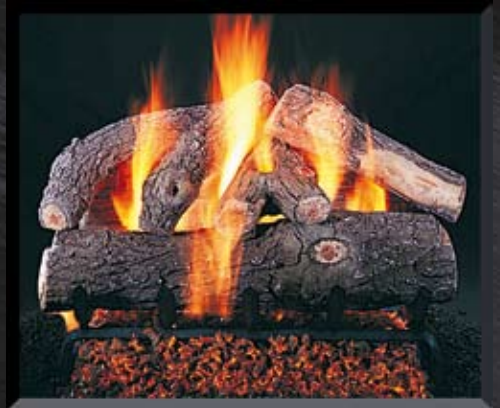
Frosted Oak (S) 18-33"