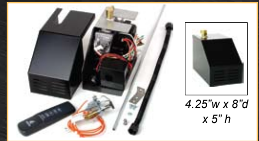
Battery Operated—install inside firebox EIS-RS150 NG/LP—150,000 max BTU A/C or Battery Operated—install outside firebox EIS-RL150 NG/LP—150,000 max BTU