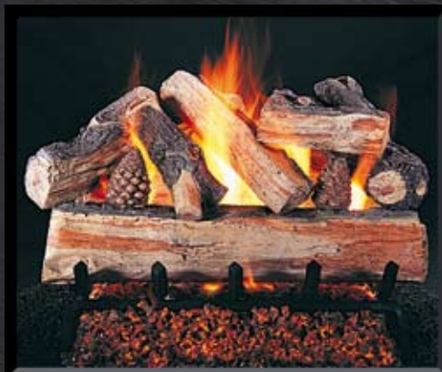
Cross Fire (XF) 18-30" (Reversible logs - bark or split)