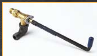
Manual On/Off Valve (V17B)