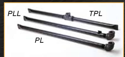
Log Lighter Valves & Keys