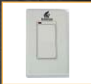
Wall Switch (WS-2R)