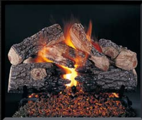
Evening Prestige (EPR) 20-36”