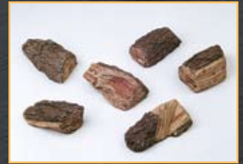
Chip Kit (CPCP)