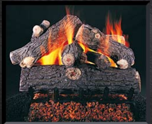
Prestige Oak (PR) 18-60"