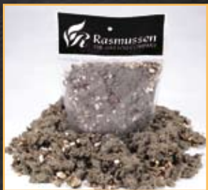
Ember Magic (EMX)