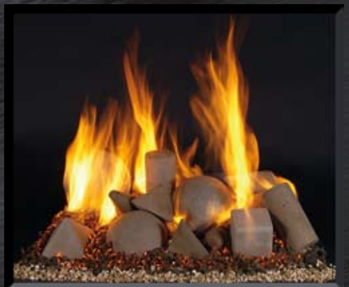
FireShapes™ (Shown: Natural Color on CXF Burner)