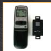
ON/OFF Remote with Thermostat IR (IRRC)