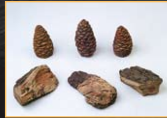
Chips & Tiny Pine Cones Kit (CPPT)