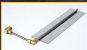
Ember Booster (EB) Increases ember bed on F burner