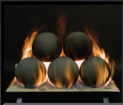
Fireballs™ (Shown: 8” Dia., Black Color on CS Burner)

Alterna™ Sets are perfect if you’re looking for something different or less traditional than a wood log set. They are a great complement to modern decor and are available in a variety of styles. Visit rasmussen.biz for more options.