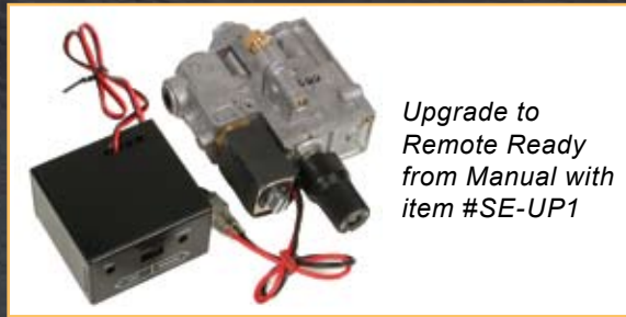
Upgrade to Remote Ready from Manual with item #SE-UP1