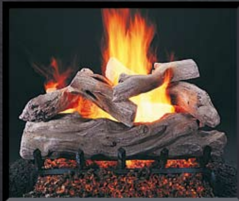
Manzanita (ML) 15-36"