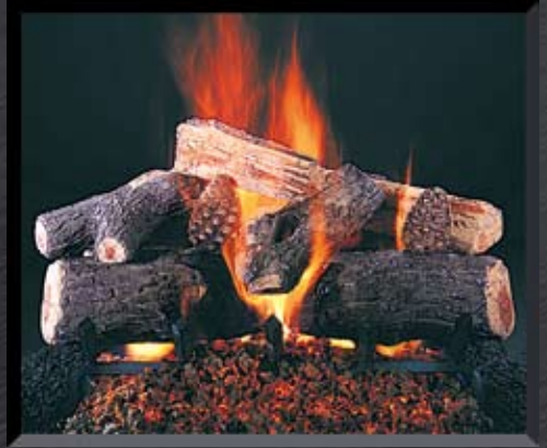
Evening Lone Star (ELS) 20-30”