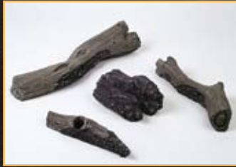
Chunk Kit (ECCHNK) for use with EC sets