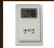
Wall Thermostat (TS-2R)