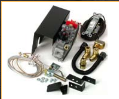
RPK3-30" and smaller (shown) RPK1-33" and above

ON/OFF Control with switch or remote lighting. Adjust flame height by turning knob.