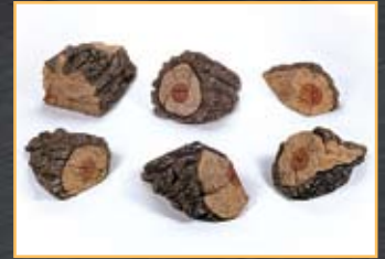
Box of Chunkers (BOC)