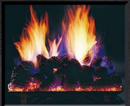
Pine Cones (PC) 18-36" (Shown on "CS" burner)

All logs shown on "FX" burner unless noted. All log styles shown are available in double-sided versions (except PH) for see-through fireplaces. Vented log sets are for use only in fully functioning wood burning fireplaces with the damper wide open.