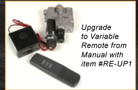
Upgrade to Variable Remote from Manual with item #RE-UP1