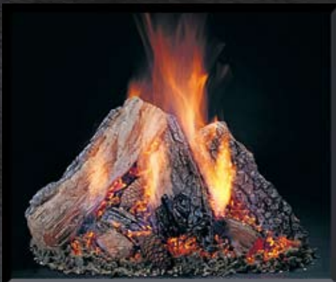
Retiring Tipi (RT) (for sm. Kivas & Rumfords w/TNA burner)