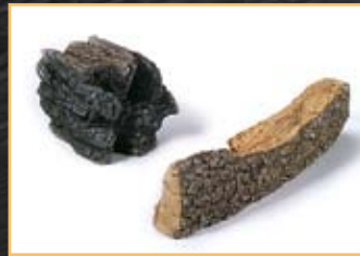
Chunk Kit (CHNK2) for use with EPR sets