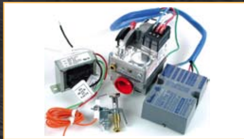
24V systems—install outside of firebox EIS-N135 NG—165,000 max BTU/hr. EIS-N200 NG—200,000 max BTU/hr. EIS-N350 NG—350,000 max BTU/hr. EIS-P200 LP—350,000 max BTU/hr.

Pilot lights with each use with automatic spark. Pilot shuts down when burner is turned off.