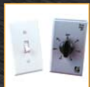
Wall Switch (WS-1) Wall Timer (WT-1)