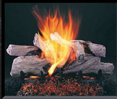
Evening Campfire (EC) 20-30”