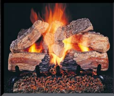
Evening Desire (ED) 20-30”

Evening Series Log Sets feature a broken, charred front log for enhanced realism and additional ember bed inside the log set. This creates the appearance of a wood fire that has been burning for longer than the “fresh wood” look of a traditional log set. Chunk kits can be added to the Evening Series to increase the width or fullness of the set (see last page), and when paired with our TNA burner and your favorite andirons, they are a versatile choice for narrow-backed fireplaces such as Rumfords.