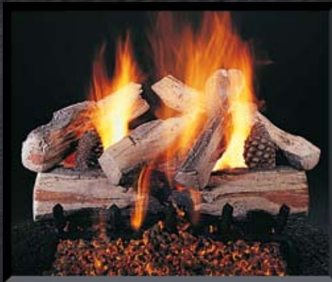
Evening Cross Fire (EXF) 20-30” (Reversible logs - bark or split)