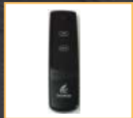
ON/OFF Remote (SR-2R)