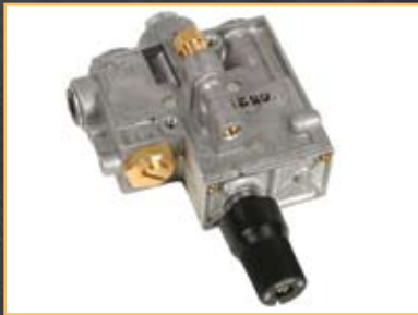
Manual Control (SPK3E) Light burner and adjust flame height by turning knob.

The "EASY" system uses a common valve that offers many control options and the ability to upgrade functionality at any time (no need to replace the whole system). Controls provide convenient lighting as well as safety shut down in the event of an interruption in the gas supply or a flameout. Good for 48" and smaller sets.