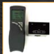
ON/OFF Remote with Thermostat RF (THR-MV1)