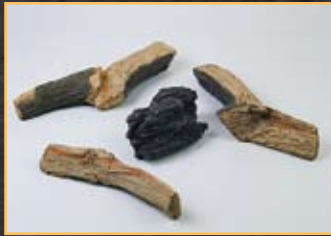
Chunk Kit (CHNK3) for use with EXF & ELS sets