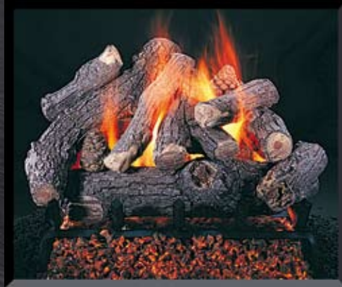
Bonfire (BF) 18-60"