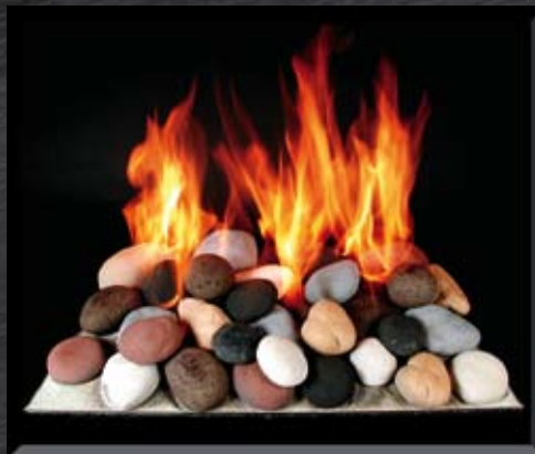
FireStones™ (Shown: Calico Colors on CXF Burner)