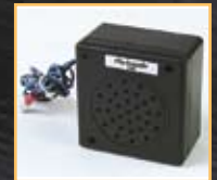
Crackler Fire Sound Generator. Use with F10AB or IRRC (CF5) Stand alone version includes RH2 (CF5SA1)