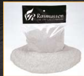
Silica Sand (SS) Pan filler for Natural Gas