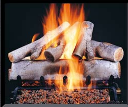
Birch (WB) 18-30"

Traditional Log Sets feature a one-piece front and rear log together with a variety of smaller pieces for stacking. Choose from several species of wood (molded from the real thing) to achieve a look that blends with your surroundings. Several sets feature reversible logs that can display either a bark or split side, and numerous optional chunk, chip, twig and pine cone kits are available (see last page). Pair with the burner style of your choice to create the look you desire.