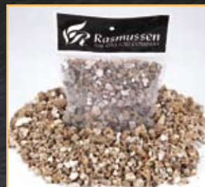
Extra Coarse Vermiculite (MGX)