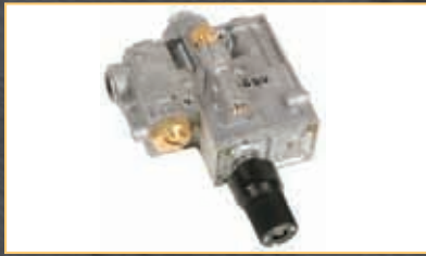
Manual Control (SPK3E) Light burner and adjust flame height by turning knob.

“EASY” Safety Pilot Lighting Controls The “EASY” system uses a common valve that offers many control options and the ability to upgrade functionality at any time (no need to replace the whole system). Controls provide convenient lighting as well as safety shut down in the event of an interruption in the gas supply or a flameout.