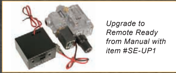
Switch/Remote Ready Control (RPK3E) Light burner with receiver switch or one of the five Wireless Transmitter Devices below. Adjust flame height by turning knob.