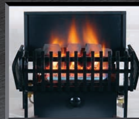
C9 with "Classic" Basket

Chillbuster CoalFire™ let you enjoy the traditional look of a coal burning fireplace without the mess, smell or cost. Coal chunks are cast and colored just like our logs for years of trouble-free use. Available in 15" and 19" sizes.