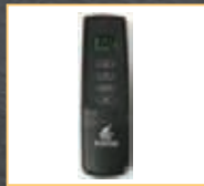
ON/OFF Remote with Thermostat (THR-2R)