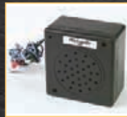
Crackler Fire Sound Generator. Includes RH2 (CF5SA1)