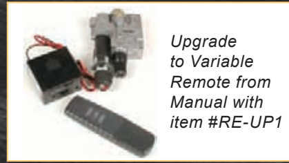
Variable Flame Height Remote Control (RMCIE) Light burner and adjust flame height by pushing button.