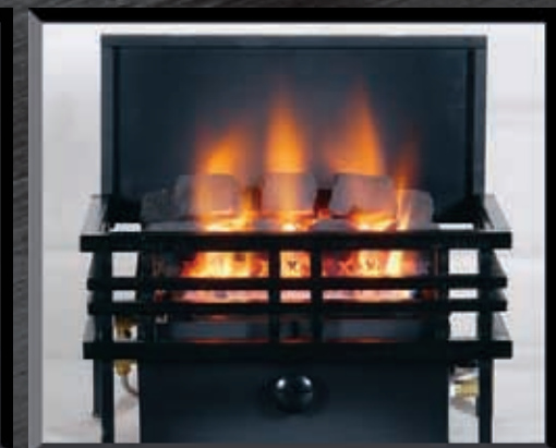
C9 with "Americana" Basket

C9 CoalFire™ with coals is also available separately for use with the basket of your choice