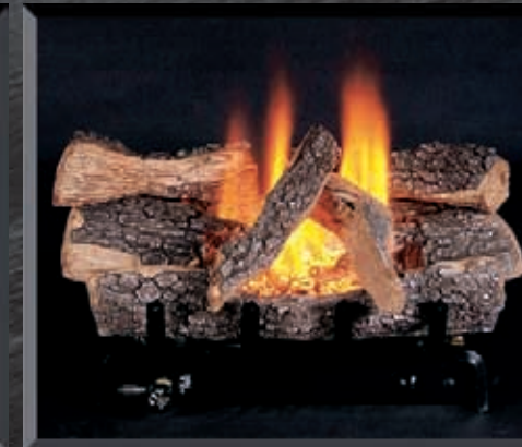
C5 Triple Burner