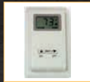
Wall Thermostat (TS-2R)