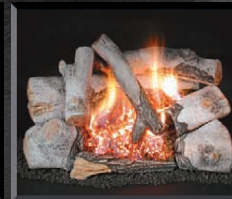
C8 Dual Burner Birch style log set