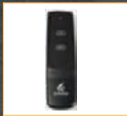
ON/OFF Remote (SR-2R)