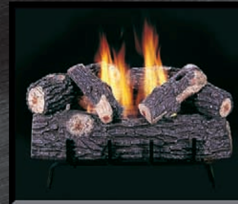
C1 Single Burner (Front log is reversible - bark or split)

Chillbuster Log Sets can be installed in a wood-burning fireplace with the flue closed, in an approved vent-free firebox enclosure, or as a reduced vent unit. Available in 18, 24, and 30" sizes for natural gas or propane.