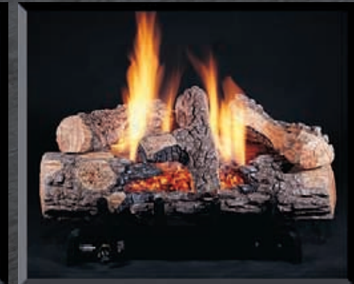
C7 Single Burner