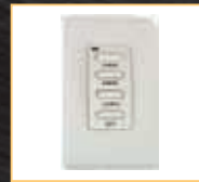
Wall Timer (WT-2R)