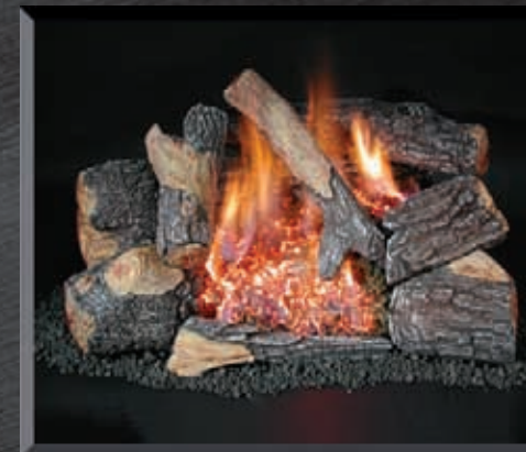
C8 Dual Burner Bark style log set