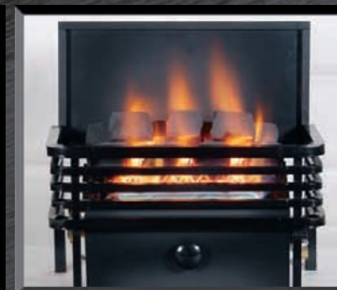
C9 with "Moderne" Basket