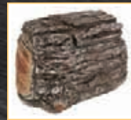
Ceramic Log House for all remote receivers (RH2)