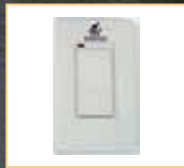
Wall Switch (WS-2R)