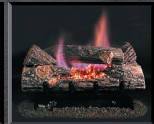
DFC7 Single Burner Double-face for see-through fireplaces